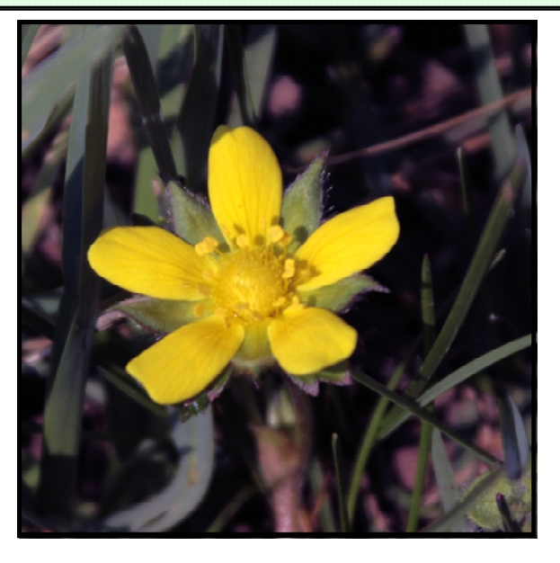
Potentilla reptans Creeping Cinquefoil

Source: The Manassas Journal – Notes From Brentsville – February 16, 1912